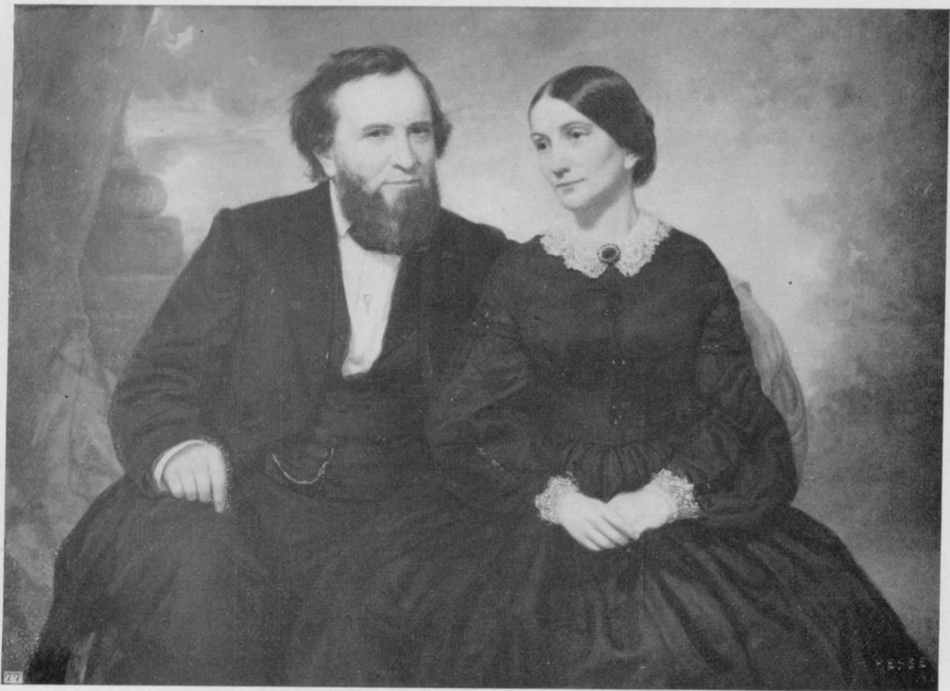
PORTRAIT OF JOSHUA FRY SPEED AND WIFE, BY G. P. A. HEALY