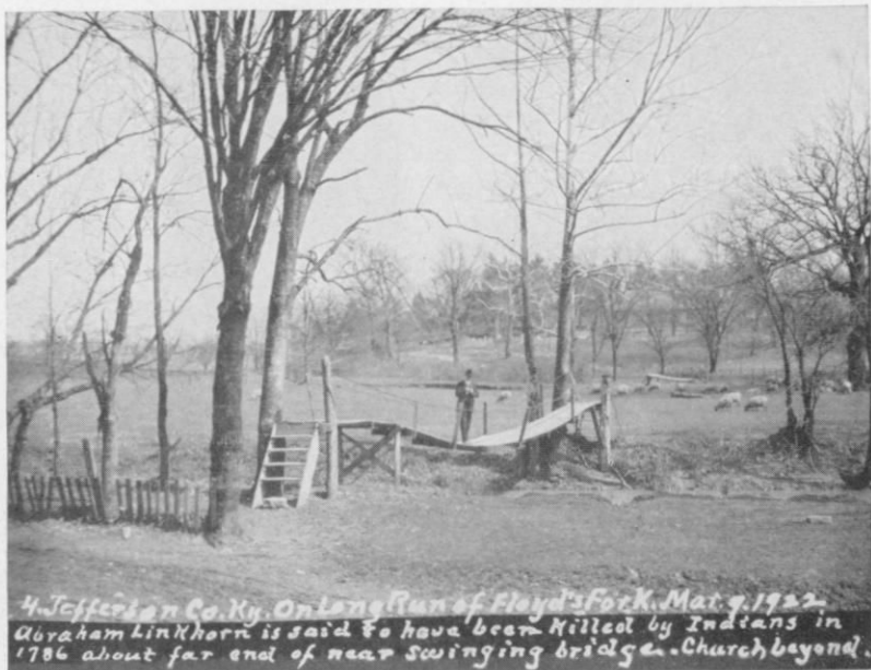
Long Run Baptist Church in background, 1922