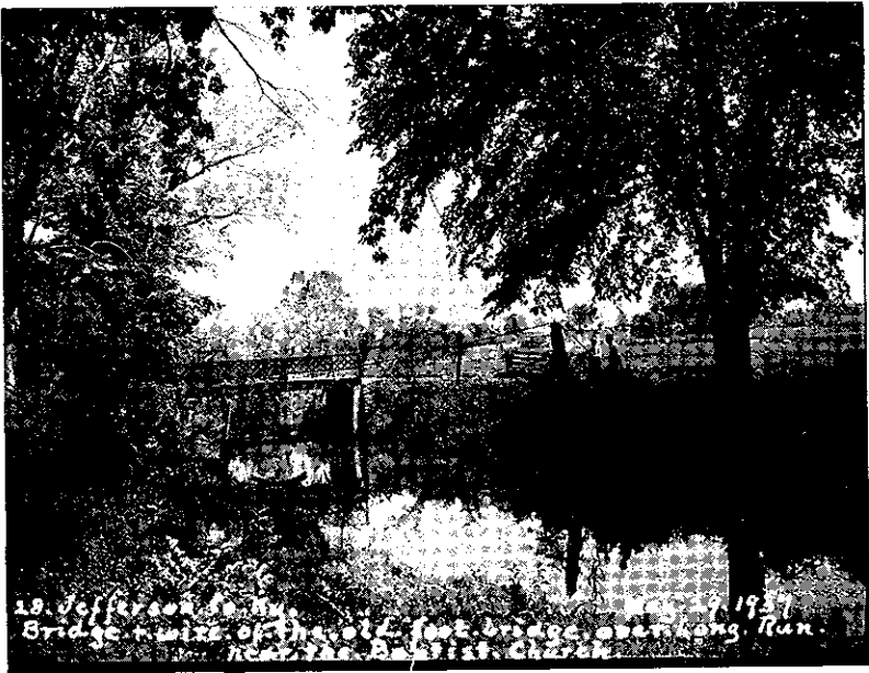
The present bridge, 1937