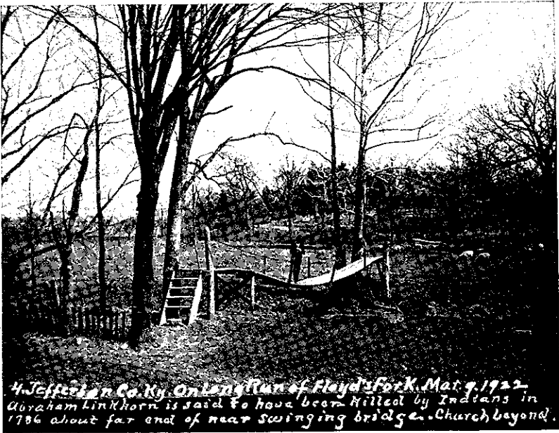
Long Run Baptist Church in background, 1922