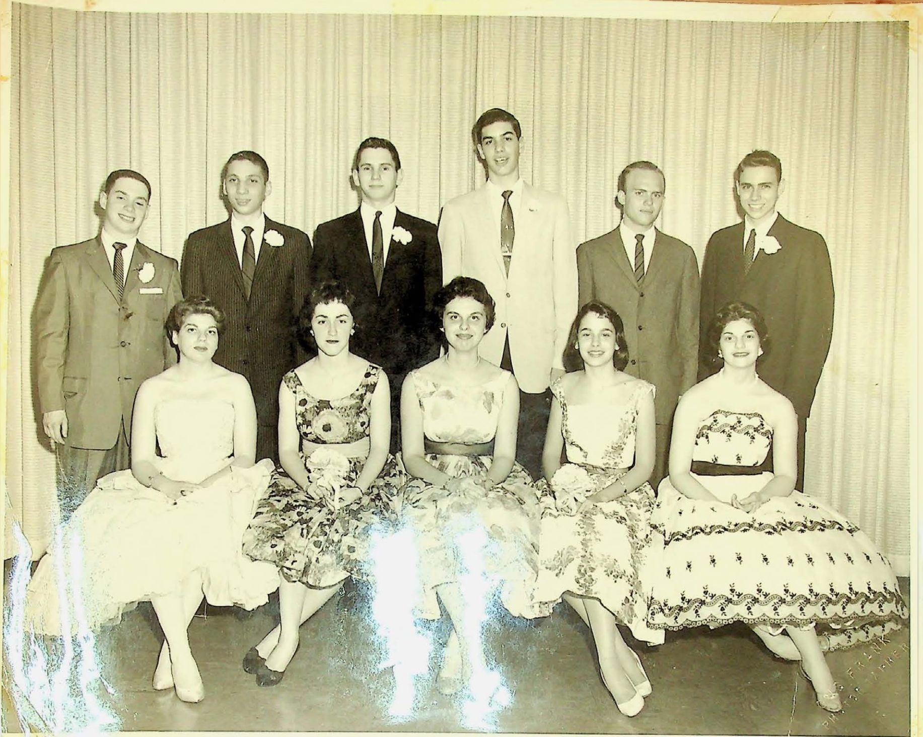
Candidates for Promes + Junior 1950