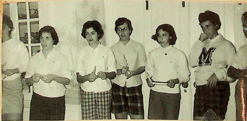
↑ The Victims ←