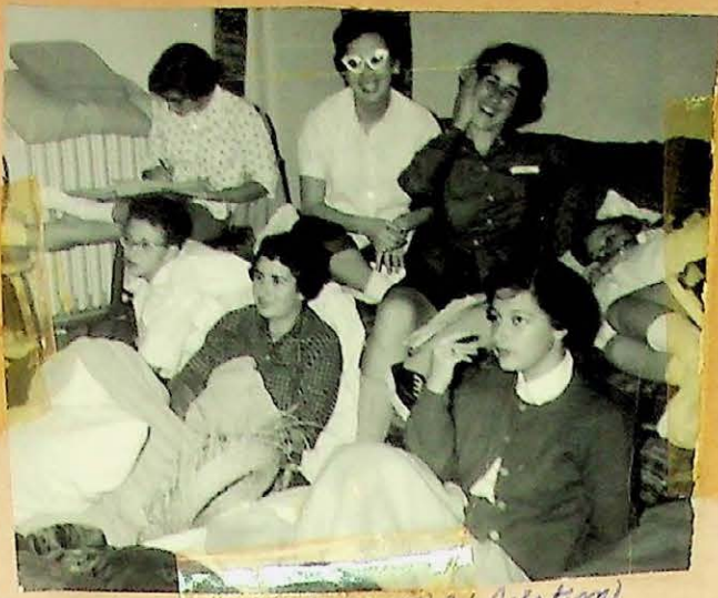
And she was a & over a netem.