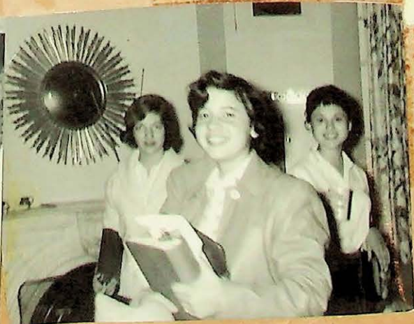
Going home at last!