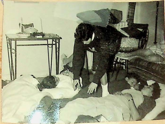
Ok! I'll never make it down.