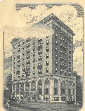
THE MONTICELLO. CHARLOTTESVILLE, VA.