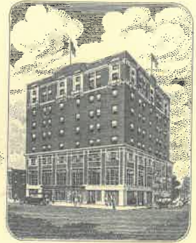
HOTEL HICKORY HICKORY, N. C.