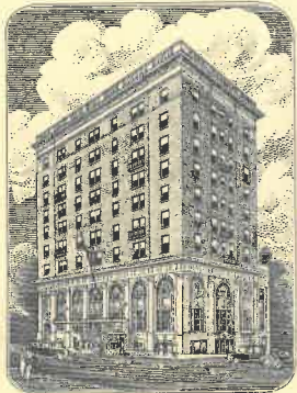
THE MONTICELLO CHARLOTTESVILLE, VA.