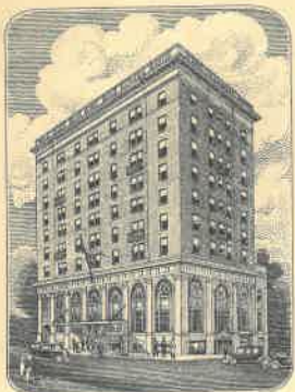
THE MONTICELLO CHARLOTTESVILLE, VA.