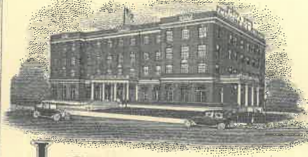
HOTEL CUMBERLAND MIDDLESBORO, KY.