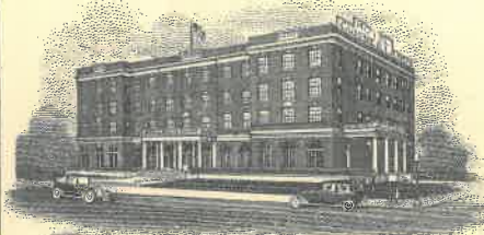
HOTEL CUMBERLAND MIDDLESBORO, KY.