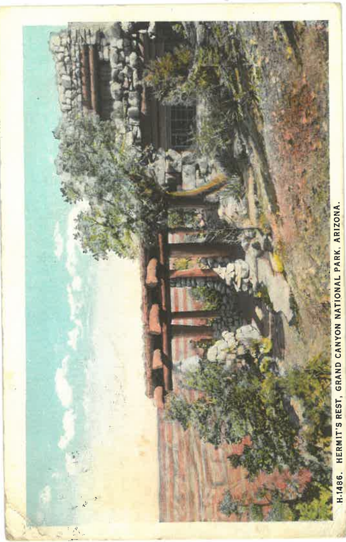
H-1486. HERMIT'S REST, GRAND CANYON NATIONAL PARK, ARIZONA.

POLYTECHNIC ELEMENTARY SCHOOL PASADENA, CALIFORNIA