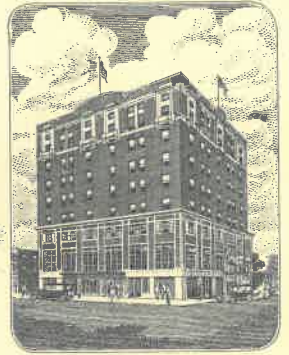
HOTEL HICKORY HICKORY, N. C.