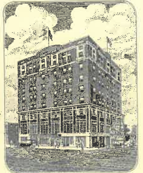
HOTEL HICKORY HICKORY, N.C.