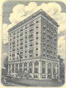
THE MONTICELLO CHARLOTTESVILLE, VA.