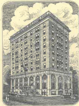
THE MONTICELLO CHARLOTTESVILLE, VA.