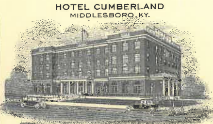
HOTEL CUMBERLAND MIDDLESBORO, KY.