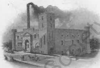
OLD TAYLOR DISTILLERY FOUNDED 1819—REHABILITATED 1903 TO 1906