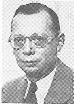
DR. OTTO POLLAK

In his morning institute on Wednesday, Dr. Pollak will discuss the relationship between industrial civilization and the basic personality type found in the United States; various cultural characteristics. The psychological impact of modern technology, the market system, social mobility, and mass civilization will be contrasted with the social worker's concern about individualized helping, freedom from the discomforts associated with competitiveness, compulsivity and exaggerated conformity strivings.