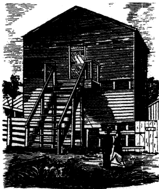
Drawing of the Knox County Jail, from the History of Knox County, Illinois, 1878.